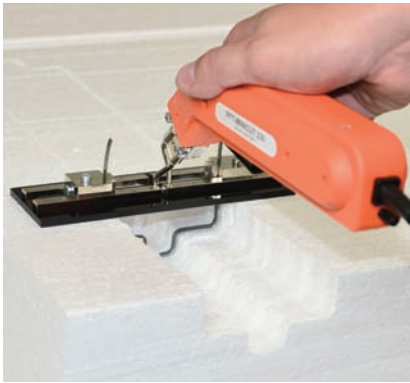
Free selectable forms, e. g. slot cuttings caused by simple bending of the cutting strap.