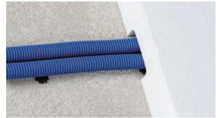
... for laying a empty conduit system.