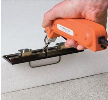
PFT MINICUT 230 mm with section-adapter