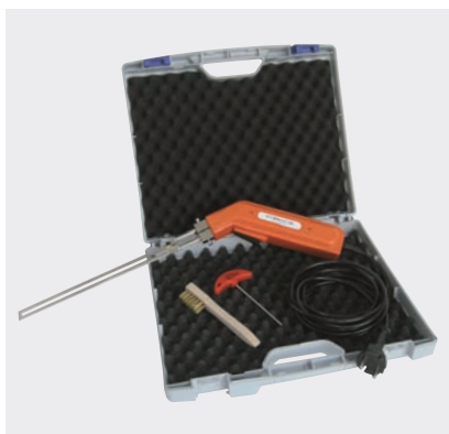
PFT MINICUT 230 mm in case