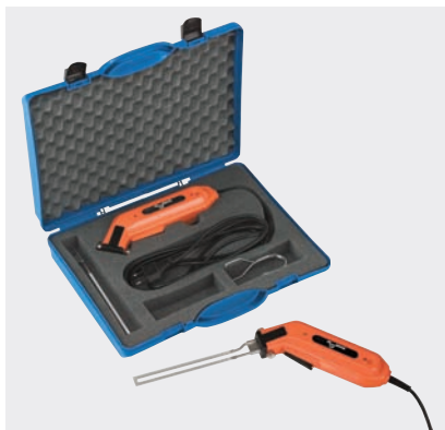
PFT MINICUT 140 mm in case